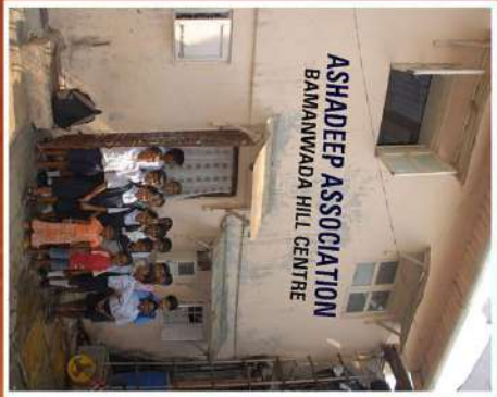
BAMANWADA HILL CENTRE