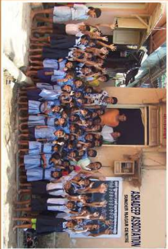
SUNDER NAGAR CENTRE